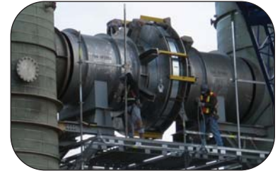
in-line Pressure Balanced Expansion Joint