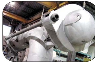
Elbow Pressure Balanced Expansion Joint