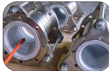
Metallic PTFE Lined Expansion Joint