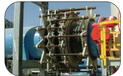
Rubber in-line Pressure Balanced Expansion Joint