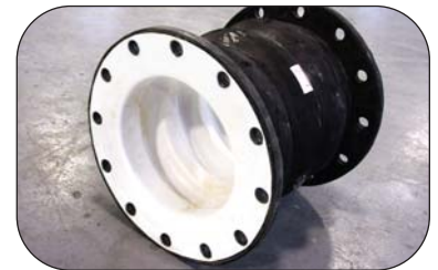
Rubber PTFE Lined Expansion Joint