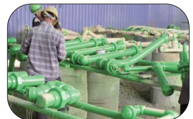
Rigid Piping Systems