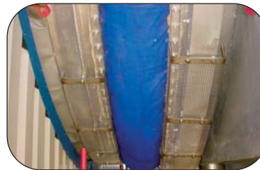
Flue Gas Corrosion Resistant Ducting Expansion Joint