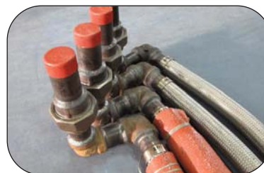
Flexible Piping Systems