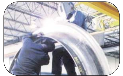
High Core Bellows Expansion Joint